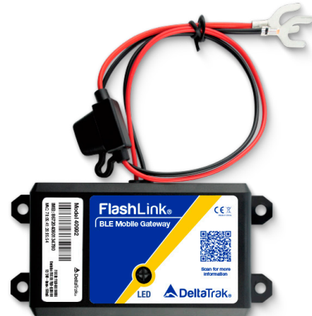
Model 40992 Mobile Gateway